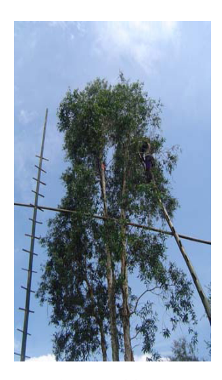
Figure 2. Picture of branches of Melaleuca cajuputi subsp. cajuputi

Cajuputi flowers was categorized hermaprodite. Male and female fertility of a tree is measured by the estimated number of flowers and fruits respectively produced by the tree. Gender fertilities were calculated as the number of reproductive structures (flowers and fruits) produced by a tree relative to the total structures produced by all trees. It was computed based on the estimated number of flowers (assumed to be equal to male fertility) and fruits (assumed to be equal to female fertility) for each tree. Total fertility of a tree (pi) was taken as the average of the male (mi) and female (f) fertilities of each tree. Sibling coefficient ( \Psi ) is the probability that two genes randomly drawn from the gamete gene pool originates from the same parent compared to the probability if the parents have equal representation (Kang & Lindgren, 1999). Sibling coefficient is a measure used to describe fertility variation among the trees in a population. It is calculated from the number of families in the orchard (N) and individual fertility (pi) of each family as the following: