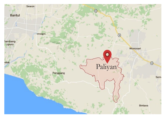
Figure 1. Location of Paliyan Seedling Seed Orchard

The research was carried out at the seedling seed orchard at Paliyan, Gunungkidul, Yogyakarta (at 7° 59'10.4"S latitude, 110°29'10.8