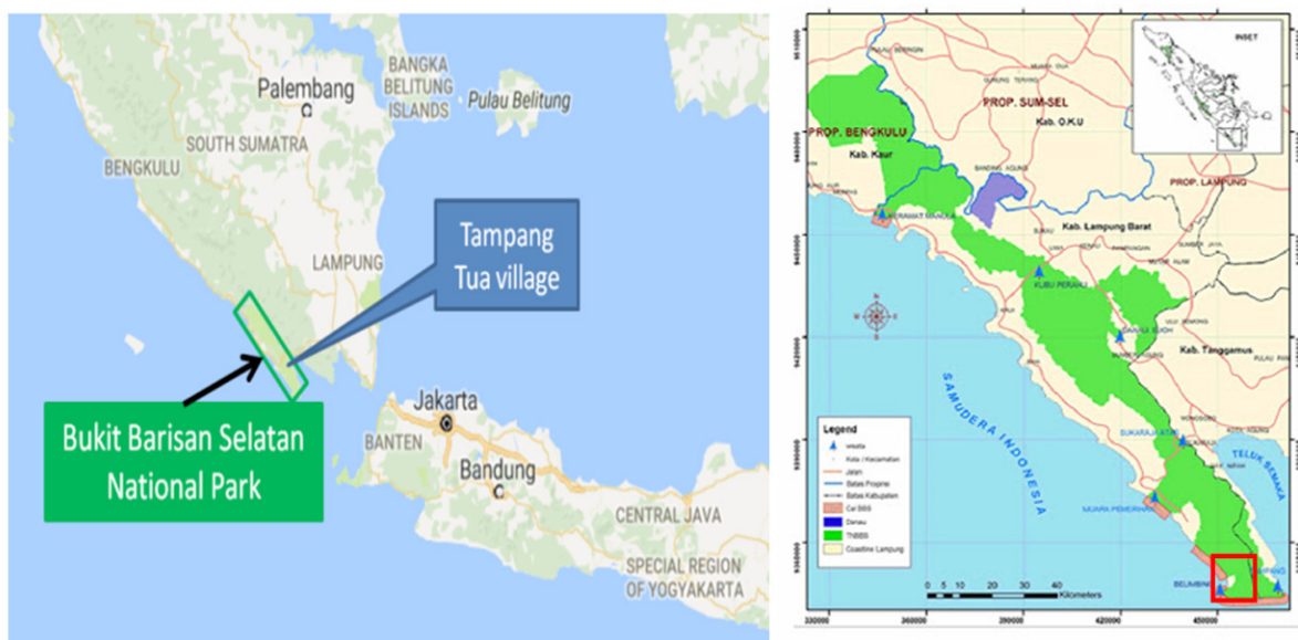
Figure 1. Research location at Tampang Tua village, Southern Sumatera, Indonesia

The experiment was conducted using latin square design with four replications and four treatments (Mattjik et al., 2002). The four treatments were: A: control (field grass ad libitum); B: field grass ad libitum + 200 g mantangan; C: field grass ad libitum + 400 g mantangan; and D: field grass ad libitum + 600 g mantangan.