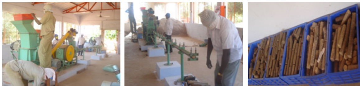
Figure 2. Processing of briquette into final product briquettes

2 showed very significant approach of use of agricultural wastes in briquetting production. Briquetting production may help to increase the socio economic status of farmers.