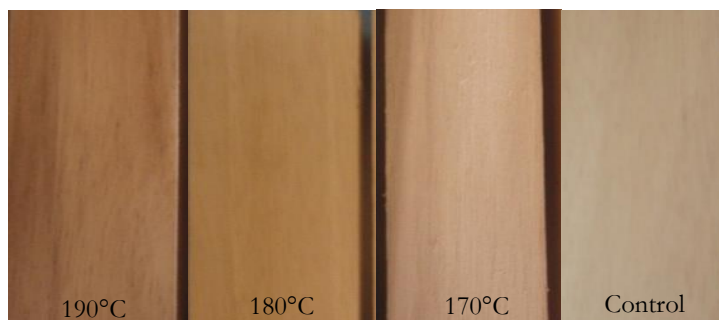
Figure 2. Surface performance of control and densified JUN wood at 170°C, 180°C, and 190°C compression temperatures